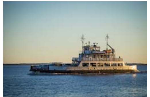
The N.C. Ferry System's M/V Croatoan on the Cape Fear River between Southport and Fort Fisher